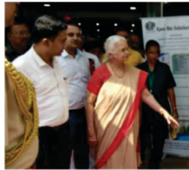
Besides Her Excellency, Governor of Goa, Smt. Mridula Sinha