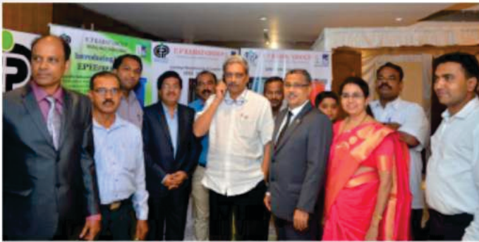
Team EP Kamat Group with the Ex Chief Minister of Goa, Late Shri. Manohar Parrikar & the Hon. Chief Minister of Goa, Dr. Pramod Sawant